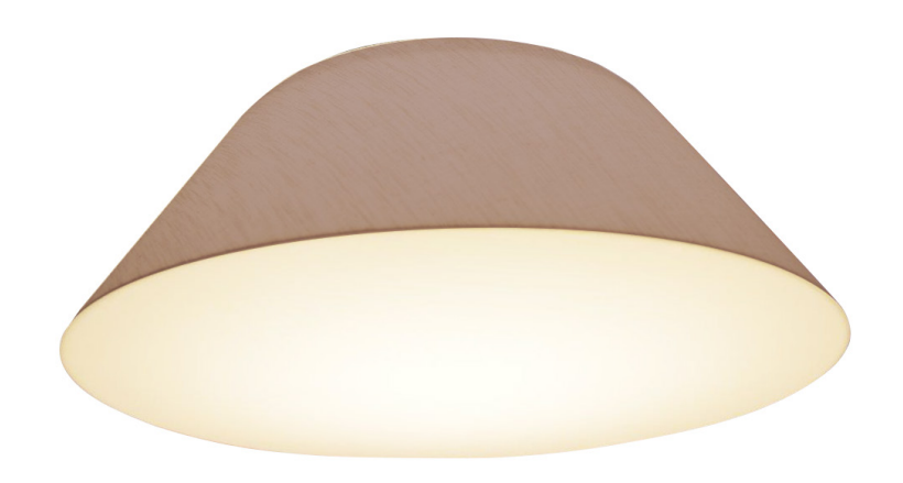
Shown with Chocolate Linen Acrylic Side Lens