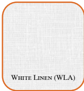
WHITE LINEN (WLA)