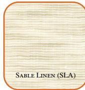
SABLE LINEN (SLA)